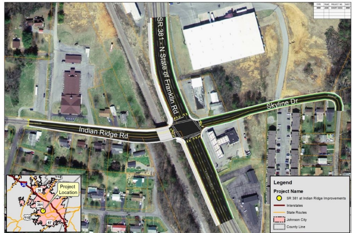
SR 381 at Indian Ridge Improvements

Preliminary Engineering - NEPA, Design and Right-of-Way Phases in previous TIPs.