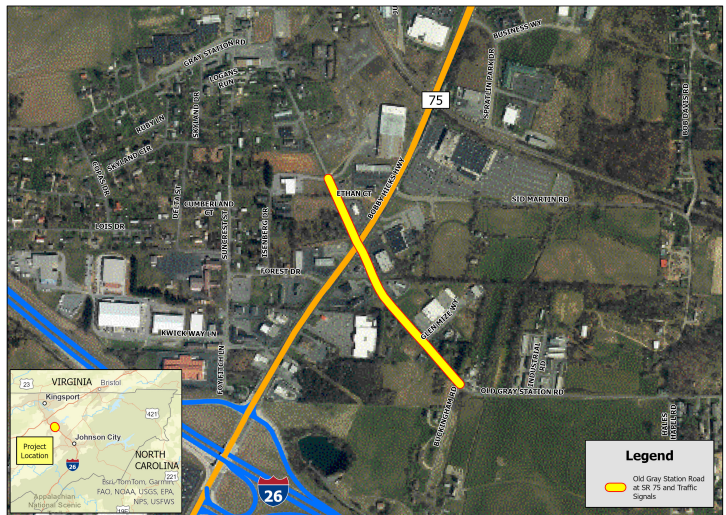
Old Gray Station Rd Section 2 at SR-75 and Traffic Signals

Amendment 3 (STIP 138) (8/7/2024) - Amended to add $700,000 in Congressional Earmark funds (DEMO ID TN295) and $175,000 in local match and move PE-N, PE-D and ROW to FY 2025, move CONST to FY 2026, and decrease the scope and termini.