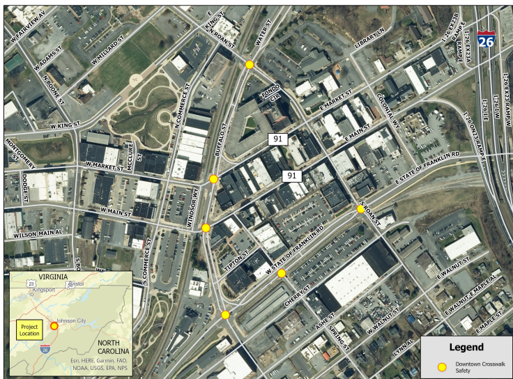
Downtown Johnson City Crosswalk Safety