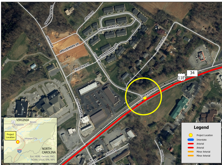
Traffic Signal for SR 34 (US 11E/ E Jackson Blvd) & Tiger Way