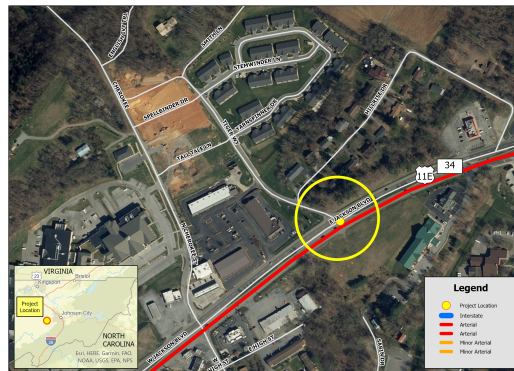
Traffic Signal for SR 34 (US 11E/ E Jackson Blvd) & Tiger Way

Modification 7 (STIP 283) (4/30/2024) - Modified to change the matching funds, currently 10% state and 10% local, to 20% state. Amendment 1 (STIP 34) (8/15/2023) - Amended to add $268,000 ($243,600 Federal and $40,000 Local) in FY 2023. The scope has been revised to add the installation of turn lanes. Modification 4 (STIP 239) (2/14/2024) - Modified to break out PE-N and PE-D phases into 80/10/10 shares. Also, CONST was modified from 80/20 to 80/10/10 share. Some phases were moved to FY 2024. PE-N in the amount of $9,400 Federal and PE-D in the amount of $24,991.48 Federal was obligated 12/20/2022. PE-N of $15,600 obligated on 8/3/2021.