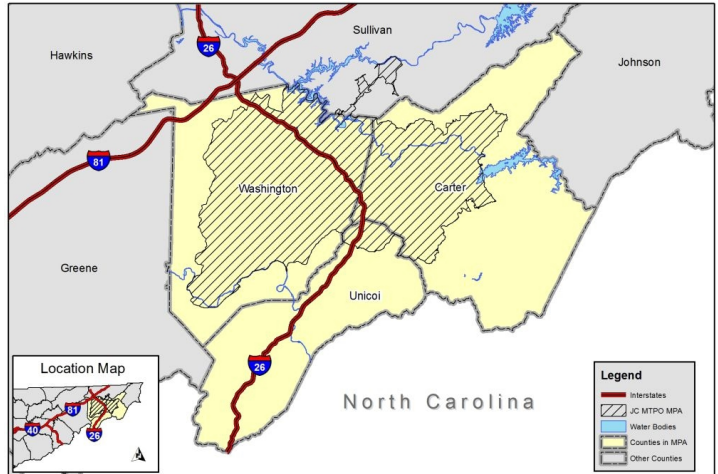
Highway Safety Improvement Program (HSIP) Grouping 1:600,000 0 2.5 5 10 15 Miles